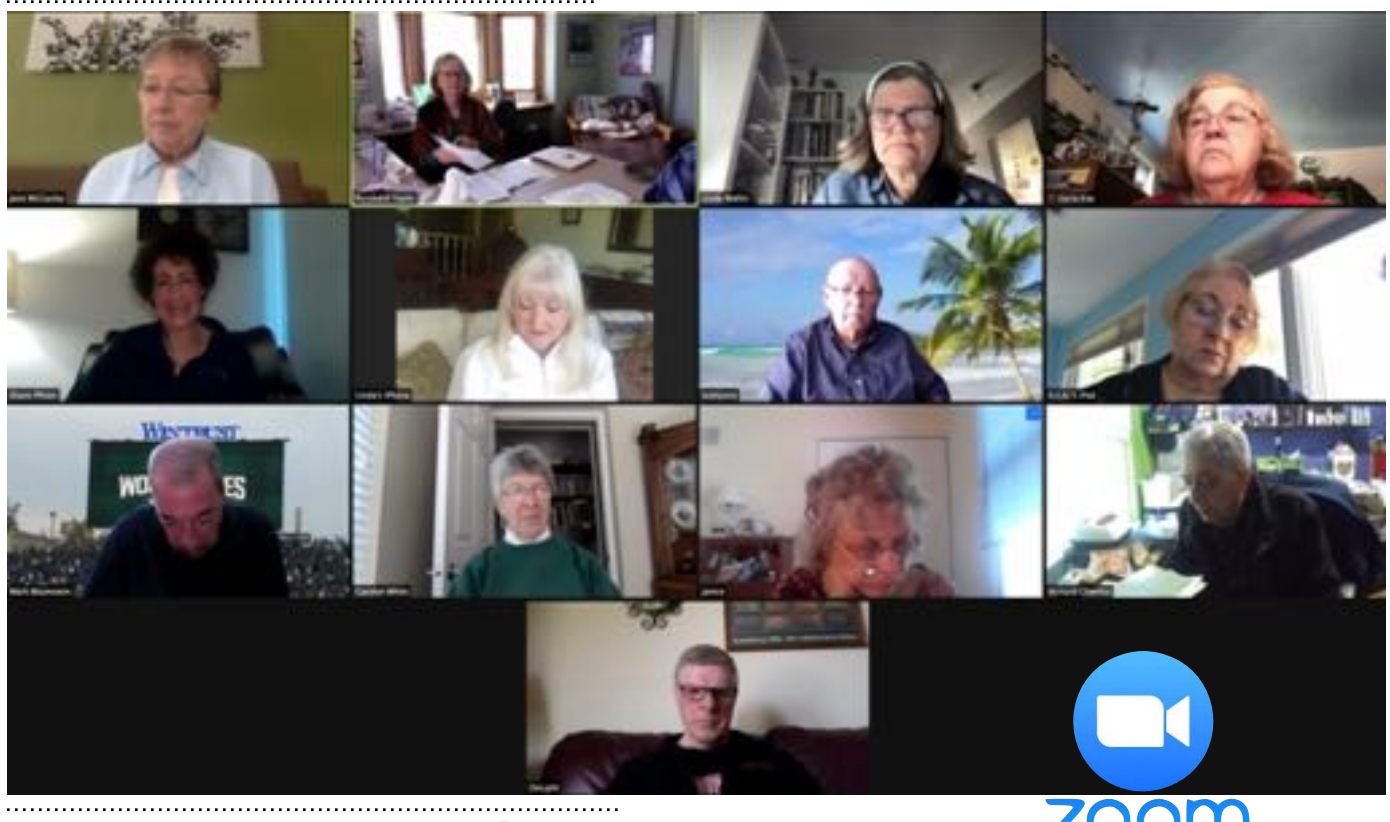
June 2, 2021 Zoom Board Mtg